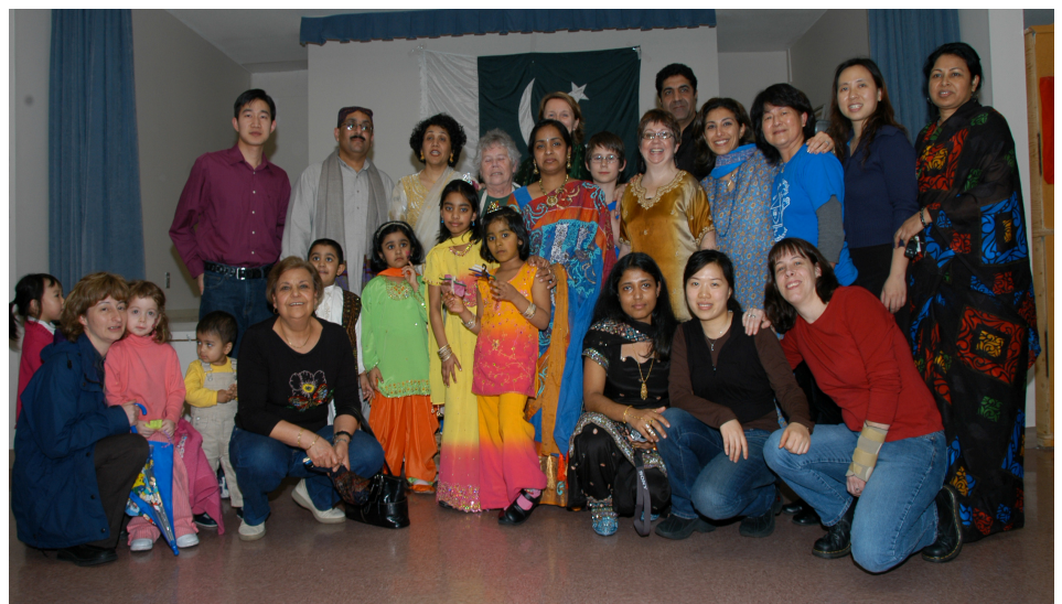
SBNH Staff and Community Volunteers at the Pak-Bangala Community Dinner

The "Sharing Cultures Community Dinner" project is looking for a facility that can accommodate 200 people, in the Metrotown/Royal Oak area.